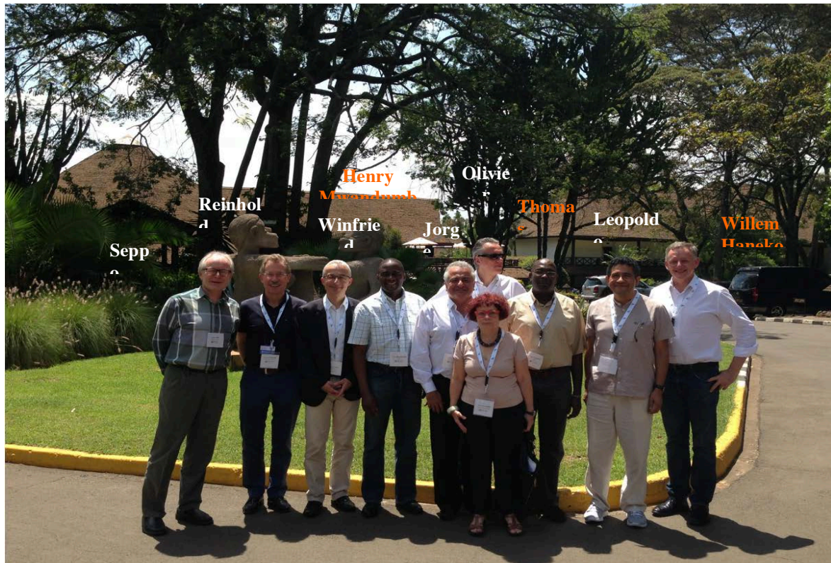
Members of IUIS and FAIS in Nairobi