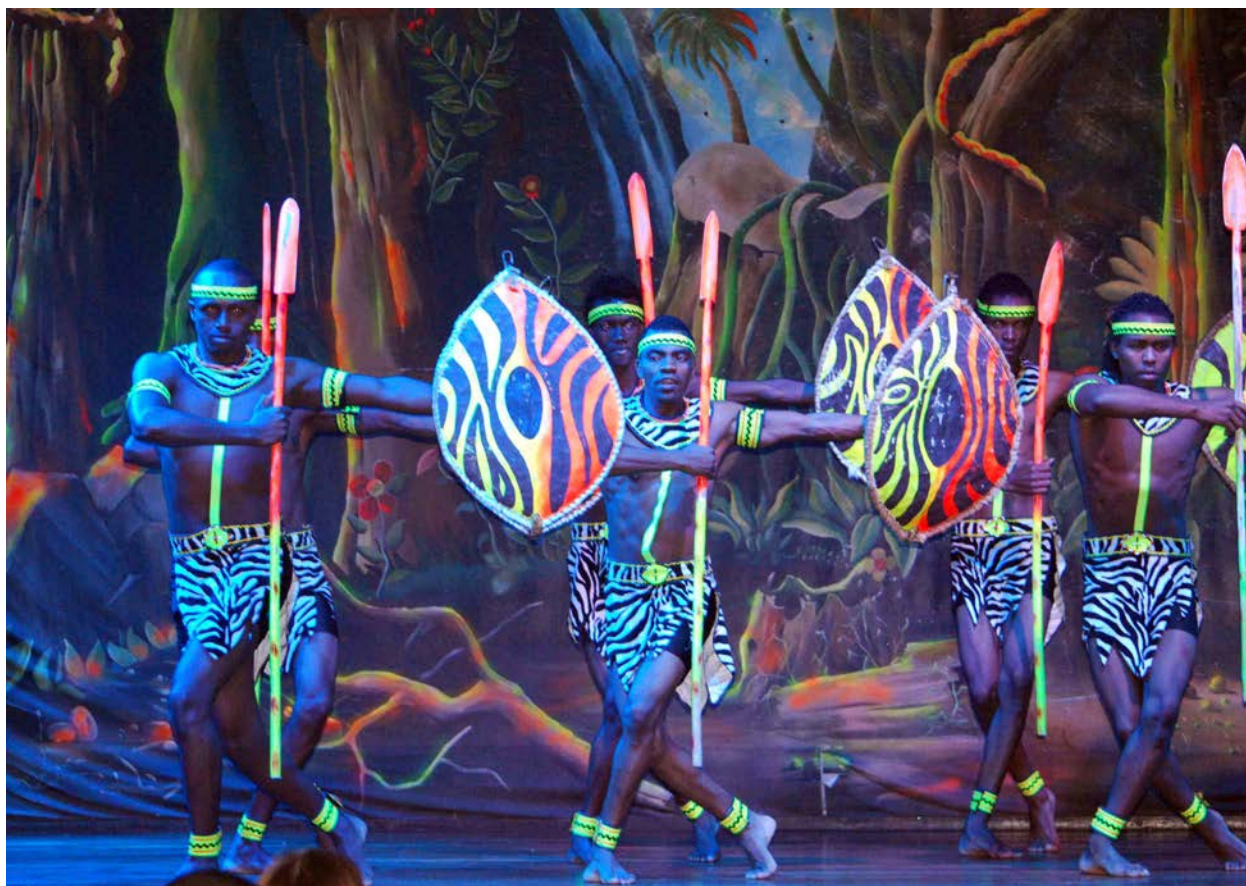
Evening performance at the FAIS meeting