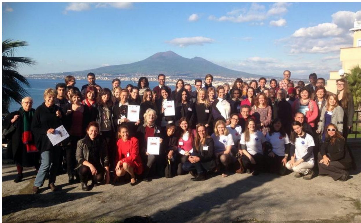
Ceppellini Advanced Course, group photo 2014.